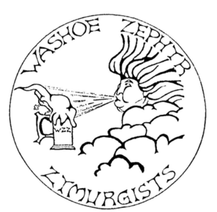
Continuing the seemingly endless and endlessly seamy saga of beer in the wild west.