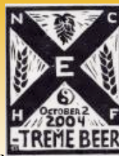
Northern California Homebrewers Festival