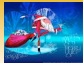
Badley Meadlicious Meading

Celebrating 20 Years of Yeast Domination