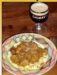
Whitbeck Culinary Challenge