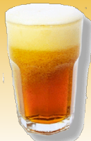
Another Day in Paradis