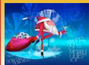
Badley Meadlicious Meading

Celebrating 20 Years of Yeast Domination