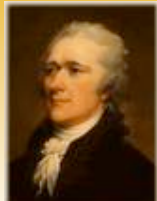
Dead White Guys