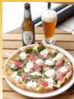
Pizza and beer!