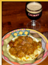
Whitbeck Beer-Food Pairing?