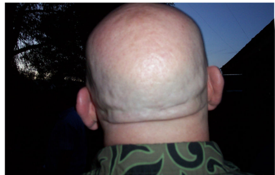
Who is this masked man??