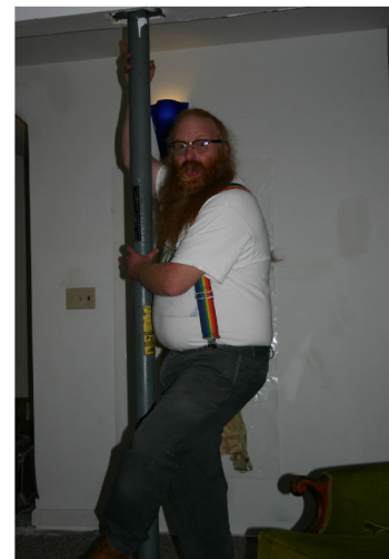
There's the pole dancer!!