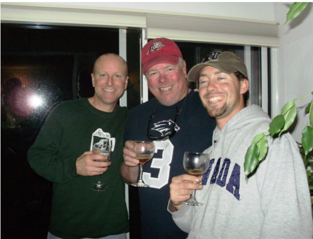
The beer guys