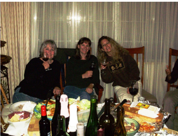
The wine ladies