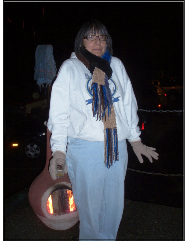
The heat is on!