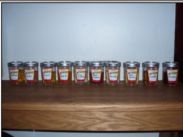
Dan's tinctures on display