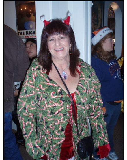
The guests showed off their holiday spirit