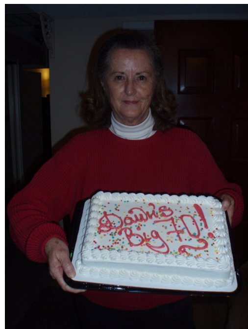
The meeting coincided with Dawn's big day