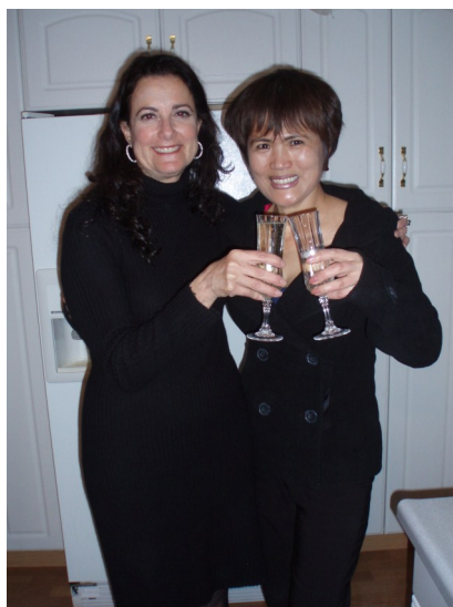
Nothing tropical about these two beauties