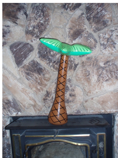
Ya gotta love cheesy inflatable decorations!