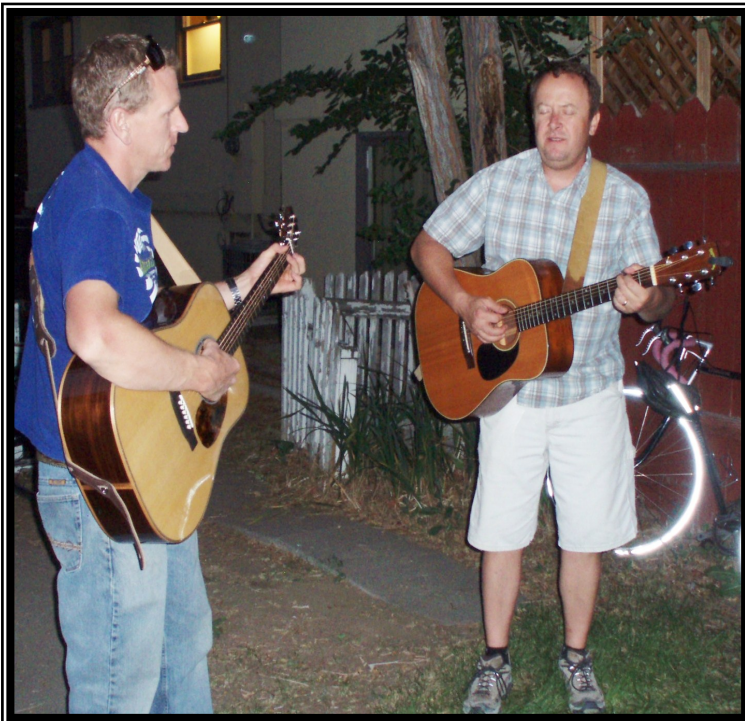
Guitars under the stars