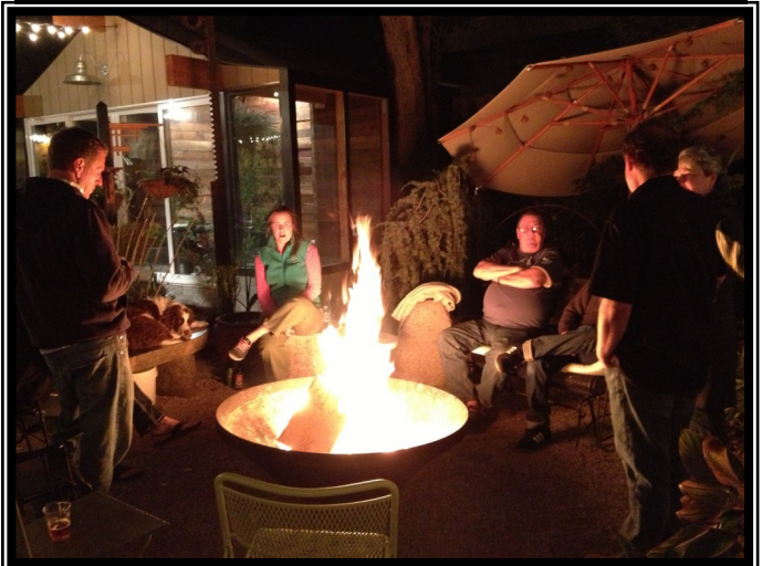
A roaring blaze kept the chill at bay