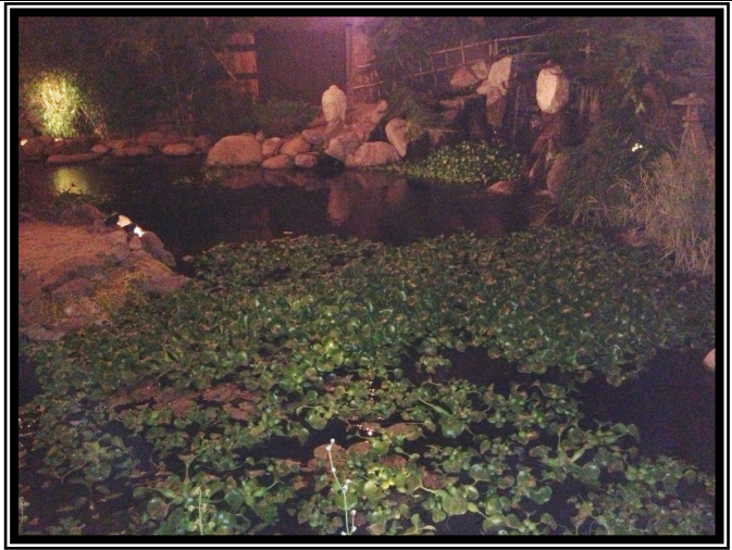
and another. These folks do good work!