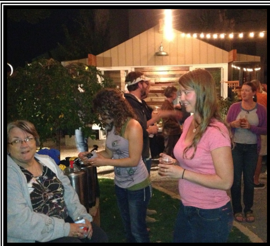
WZZ ladies rule!