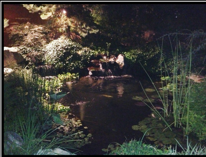
Just one of the lovely ponds out back at Sierra Water Gardens.....