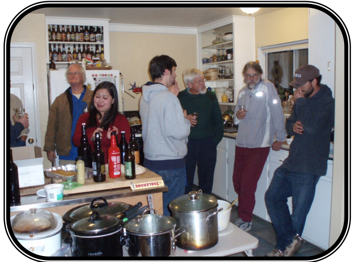
As always, the kitchen proved to be a popular gathering place