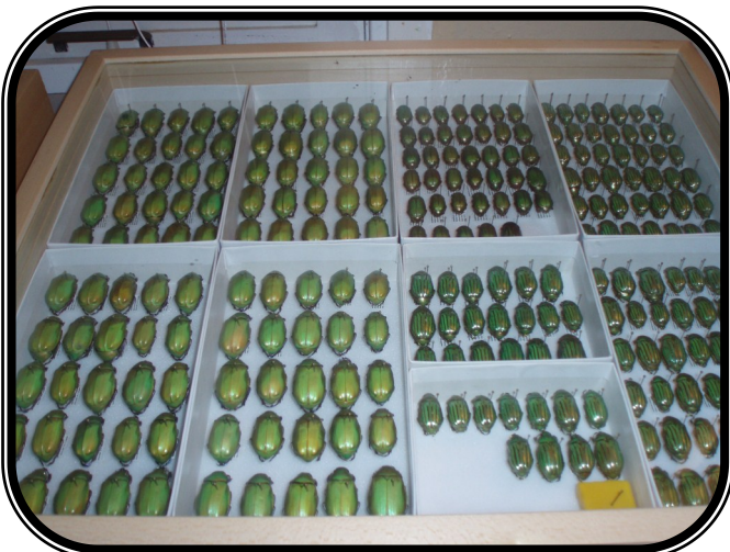
Either the world's oddest appetizers or part of Will's beetle collection