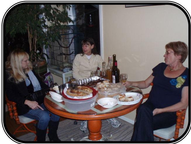
Wine, women and.....desserts!