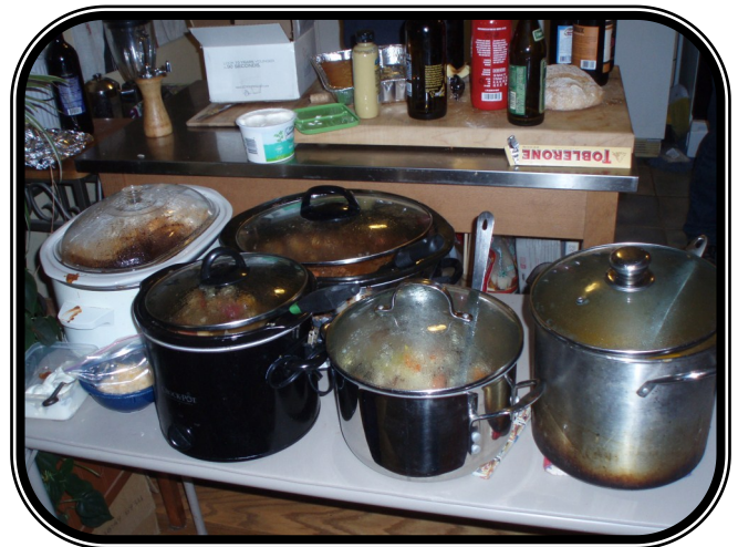
Some of the hearty fare that gives this meeting its theme