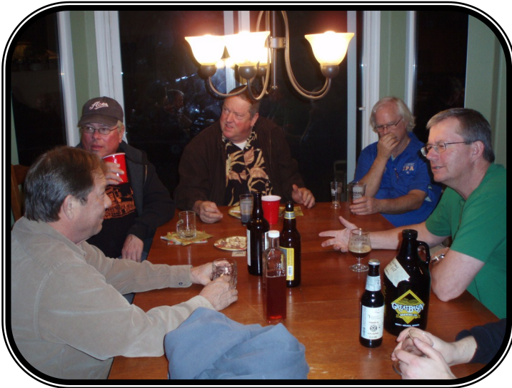
The WZZ men in deep discussion