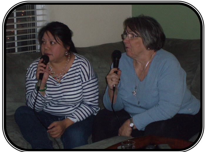
singing like songbirds.