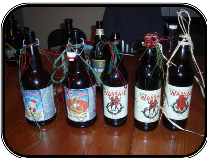
The Rednose Wassail vertical