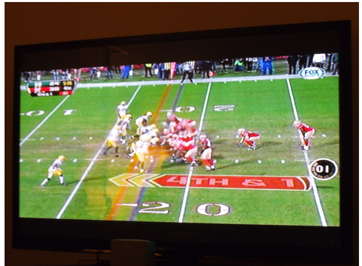
One highlight of the evening was watching the 49ers beat the Packers on this 51" plasma TV, brought in just for the game