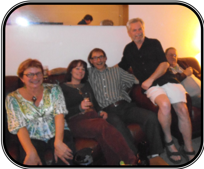
Getting cozy on the couch.