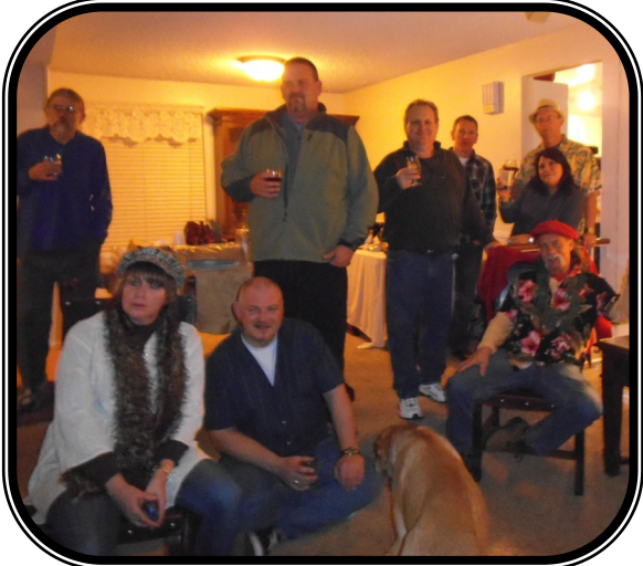
A nice group shot.