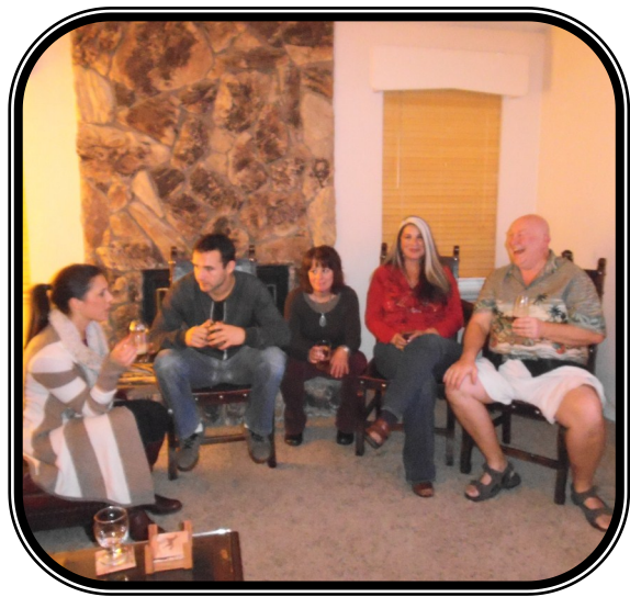
A good looking crowd.